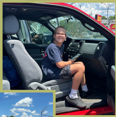
Youth served at the new PCC facility as part of their At-Home-Mini-Missions week in late June.