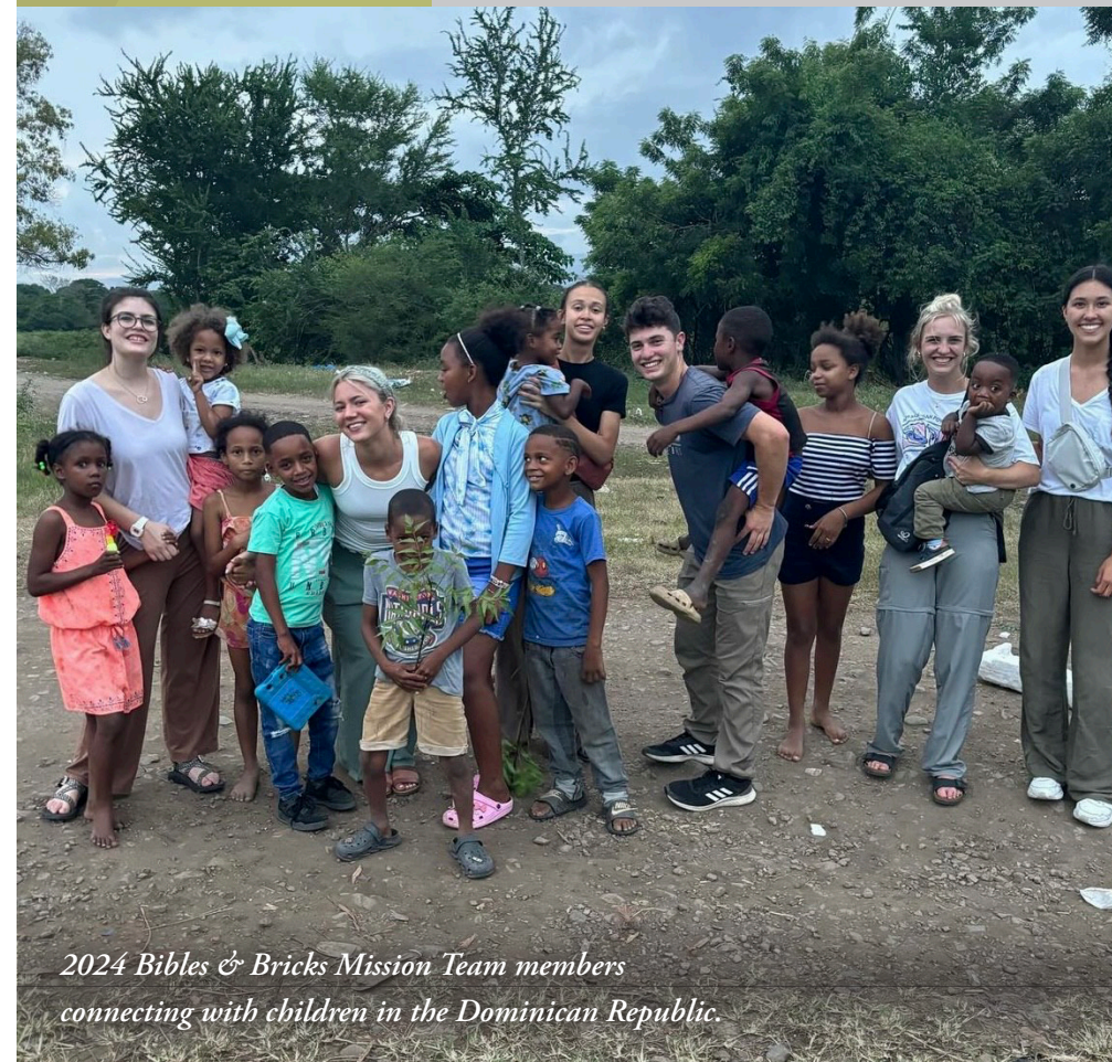
2024 Bibles & Bricks Mission Team members connecting with children in the Dominican Republic.