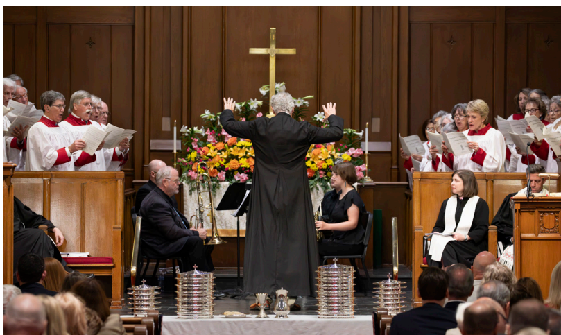
(Below) Photos from Easter Sunday.

We are deeply grateful to the congregation of Second Presbyterian Church for their continued support in nurturing the next generation of church leaders.