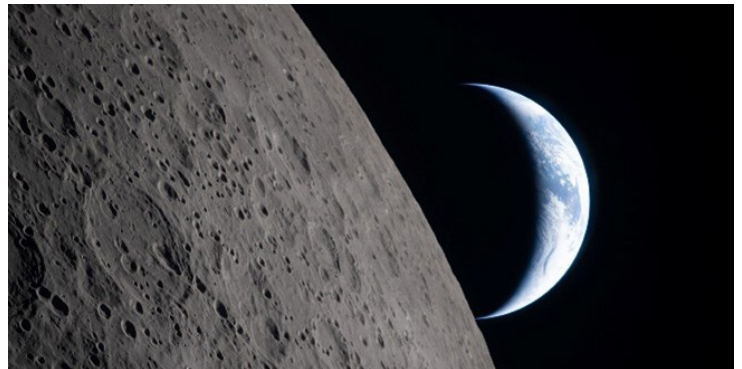
The Artemis II crew captured these images of an Earthset and crescent Earth setting beyond the moon.