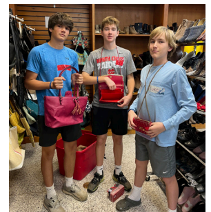
Photos from the 2025 Great Day of Service.