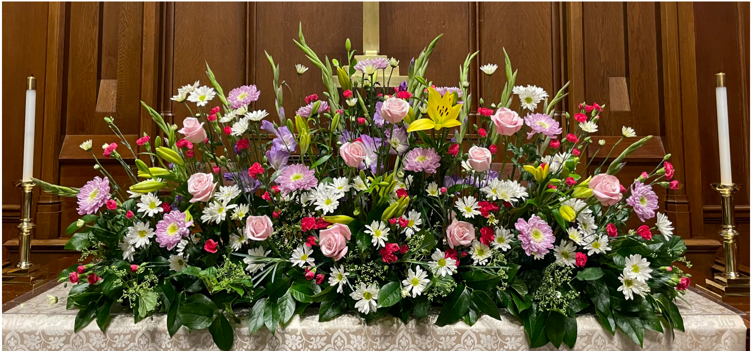
Floral arrangements in the sanctuary significantly enhance our Sunday worship experience. The April newsletter highlights flower displays from the past year. Learn more on p. 8.

Monthly Newsletter of Second Presbyterian Church