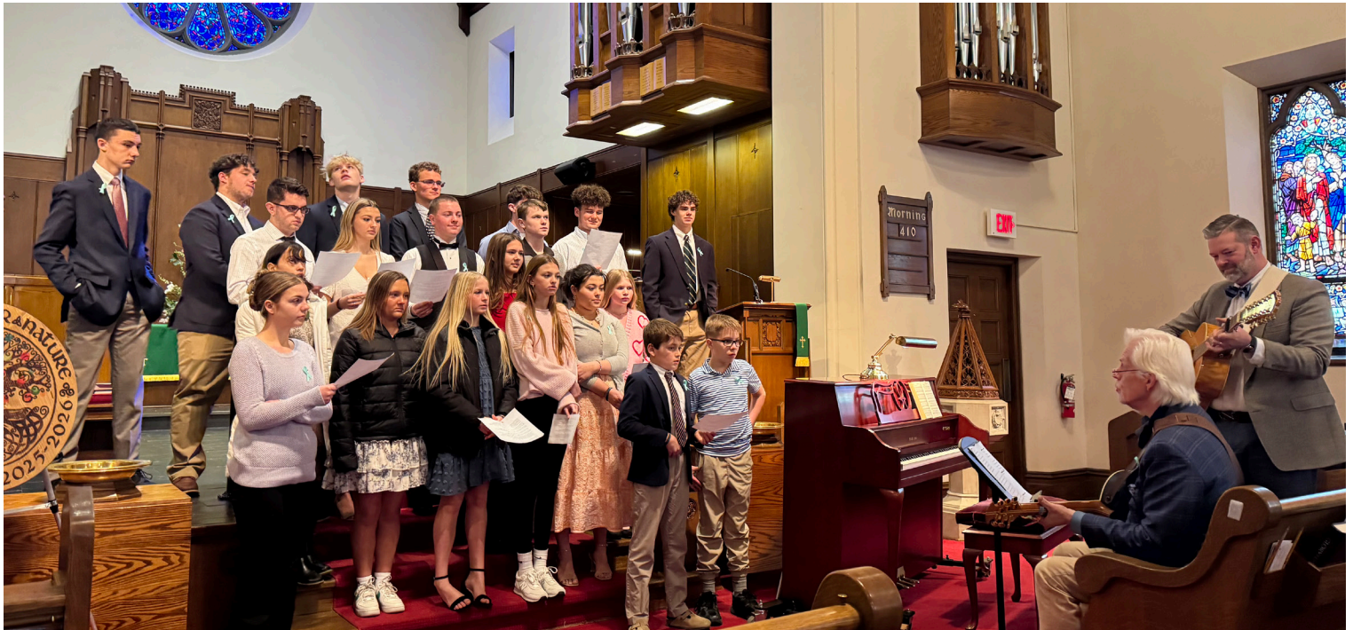
Photo from Youth Sunday, February 8. See more on p. 4.

Monthly Newsletter of Second Presbyterian Church