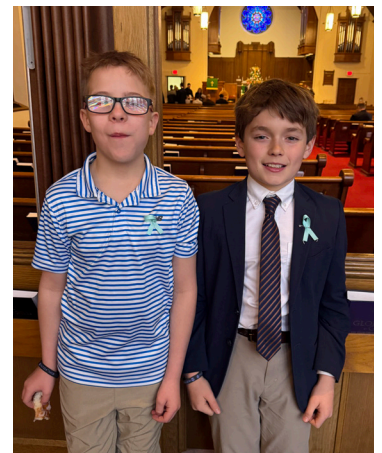
Photos from Youth Sunday, February 8.