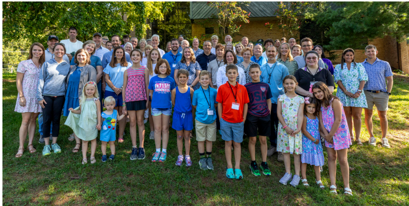
from the 2025 Trent Getaway.

With the advent of artificial intelligence (AI) and its assimilation into everyday life, church matters and remains relevant. Entrepreneur, television personality, and investor Mark Cuban recently predicted, “Within the next 3 years, there will be so much AI—especially AI video—people won’t know if what they see or hear is real.” He believes “...AI will blur the line between real and artificial, prompting people to seek authentic human connection.” Couple this with misinformation and disinformation, amplified on social media, and it’s easy to understand.