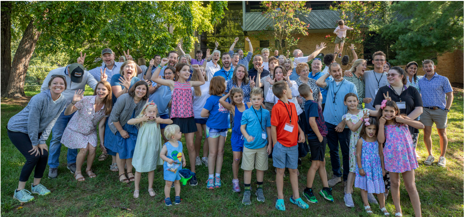
from the Trent Getaway in August.

Monthly Newsletter of Second Presbyterian Church