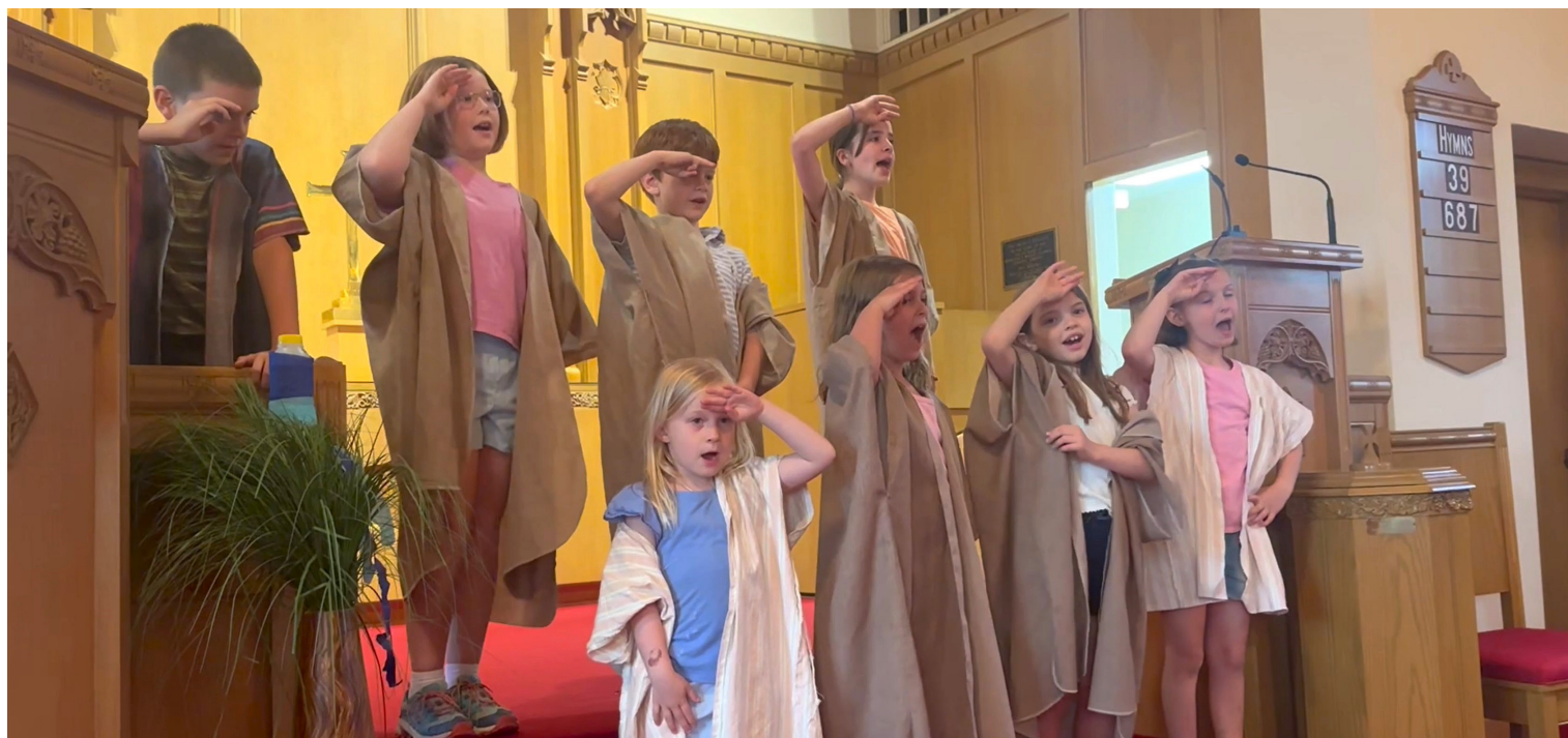
Photo from the Evening VBS Children's Theatre performance of "Wilderness Way" on June 11. See more photos on p.8.

Monthly Newsletter of Second Presbyterian Church