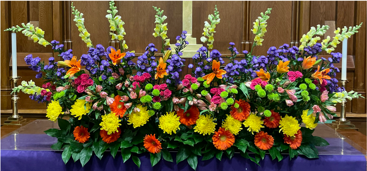
Floral arrangements in the sanctuary significantly enhance our Sunday worship experience. The April newsletter highlights flower displays from the past year. Learn more on p. 2.

Monthly Newsletter of Second Presbyterian Church