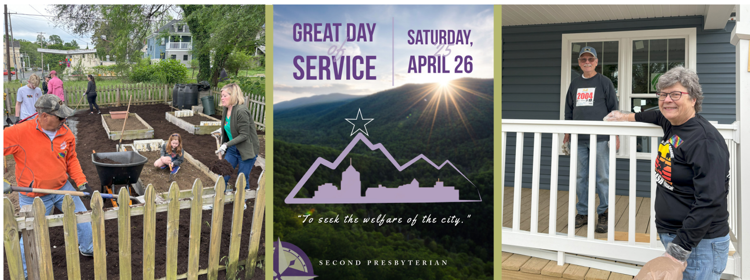
Photos from the 2024 Great Day of Service.