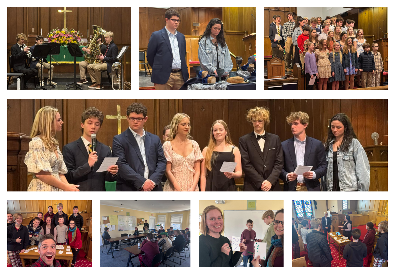
Photos rows 1 & 2 from Youth Sunday. Photos row 3 from the youth "Our Whole Lives" retreat.