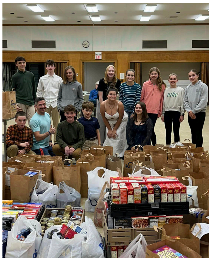
Middle school youth sorted, packed, and delivered all food items donated for their Hunger Busters initiative to the PCC on Sunday, November 17.

December 1st is the Youth Christmas Party! This year we will celebrate the season by turning back the clock with a Dashing Through the Decades party! Sift through the closet and find your flapper dress, pull out your wool coat and cashmere cardigan, flip the collar up on your leather jacket, pull out your peace necklace, white gloves, and colorful prints to go with your bell bottoms, dust off that fanny pack and scrunchy, zip up that nylon jump suit, or go grudge with baggy overalls and a flannel shirt. And remember to add your Christmas and Holiday flare!! We will be in the Fellowship Hall from 5 – 7 p.m. for dinner, games, and fun for the ages!