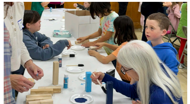
Church members enjoyed crafting at the Advent Workshop on Sunday, November 24 in Fellowship Hall.