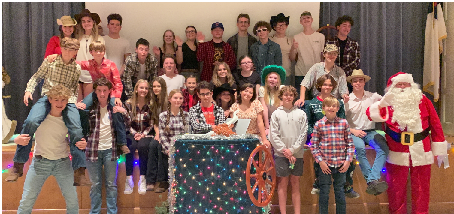
Photo from the 2PC Youth Christmas Holiday Hoedown party.

Monthly Newsletter of Second Presbyterian Church