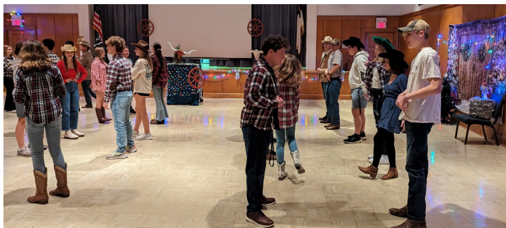
Youth enjoyed line dancing at the Christmas Holiday Hoedown party last month.