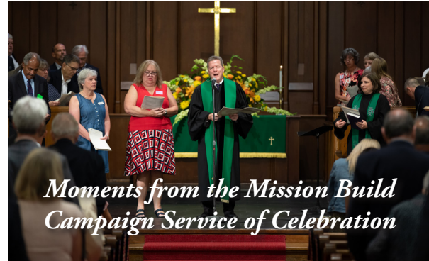
Moments from the Mission Build Campaign Service of Celebration