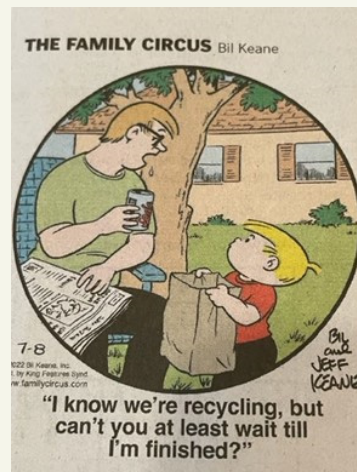
Young Enthusiast (on left)

"Grounded in Scripture, Informed by Science."