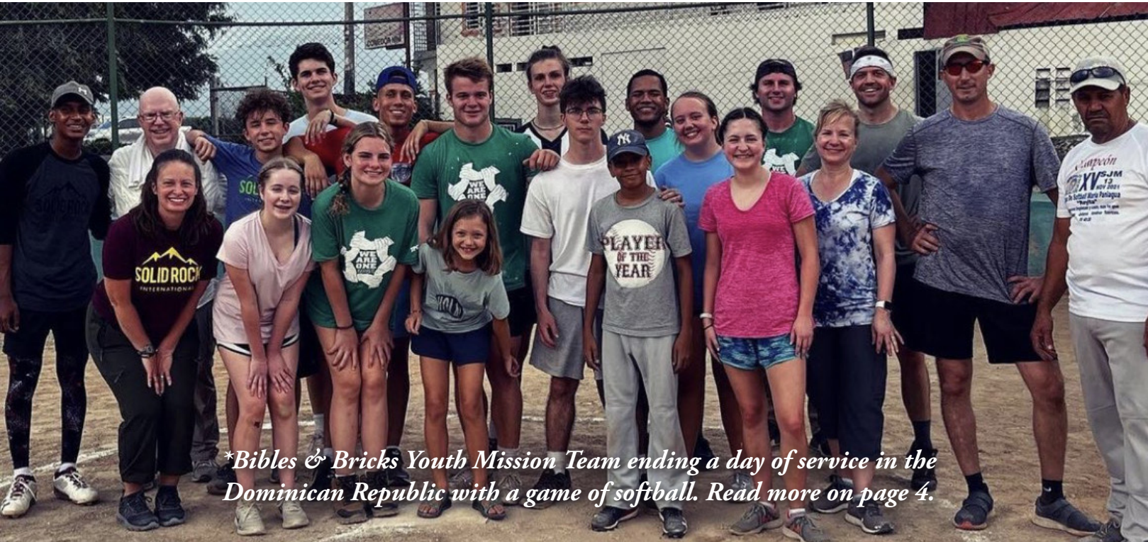
*Bibles & Bricks Youth Mission Team ending a day of service in the Dominican Republic with a game of softball. Read more on page 4.