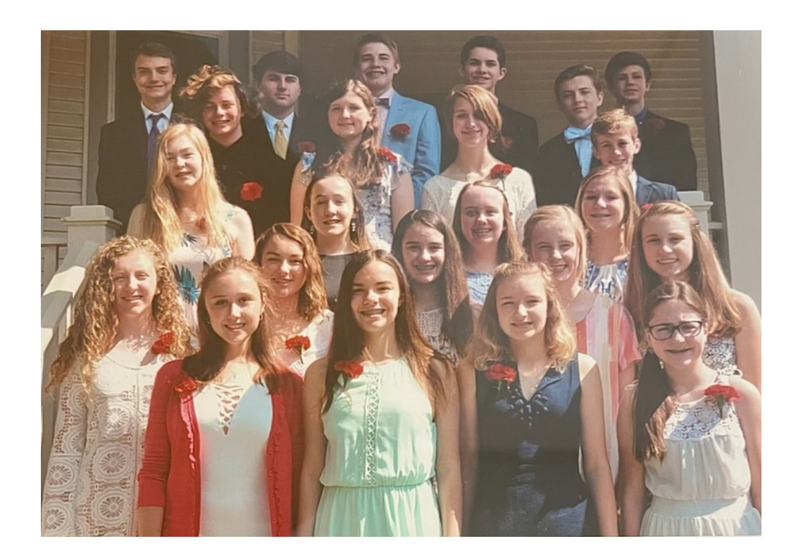
Seniors Class of 2022 pictured in their Confirmation Class of 2018. Congratulations, Seniors!

The tradition was suspended during the pandemic, but happily will be resumed the last Sunday of May. If you would like to participate, you can literally deposit pennies in a jar during meals or do the math come Sunday, May 29.