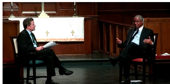
Photo on right from "A Conversation on Racism in America and the Aftermath of George Floyd's Death" held in June of 2020.

The class will be at noon on Wednesdays, beginning April 27 (bring your own lunch). We will meet at Second Presbyterian Church. Since the room will be determined by how many sign up to attend, please let the church office know of your interest in being a part of this class ( info@spres.org ).