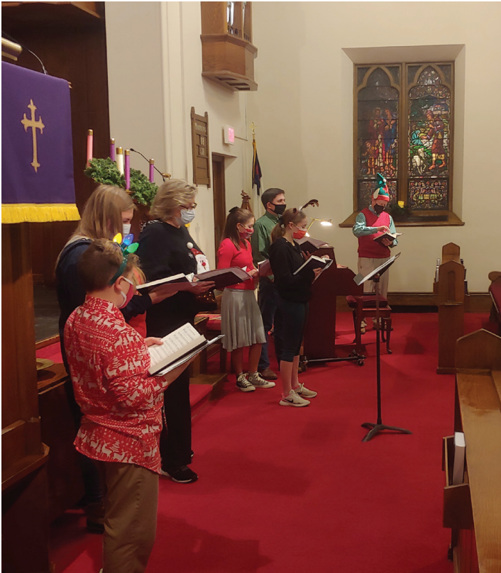
Members of all ages enjoyed fellowship and song during December's Carols, Cookies, and Cocoa event!

NON-PROFIT ORGANIZATION U.S. POSTAGE PAID PERMIT NO. 406 ROANOKE, VIRGINIA