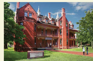
Rendering of the reconstructed Westminster Hall.

UPSem has set a goal to raise $2.5 million to establish the Dr. William R. Klein Center on the main floor at Westminster. A centrally located donor recognition plaque at the Center will acknowledge generous gifts.