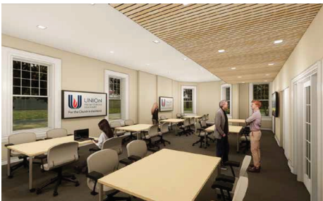
Rendering of a seminar room.

Through the generosity of Second Presbyterian Church members and the Roanoke Valley’s Presbyterian community, Union Presbyterian Seminary has set a goal to raise $2.5 million to establish the Dr. William R. Klein Center on the main floor at Westminster. A centrally located donor recognition plaque at the Center will acknowledge generous gifts.