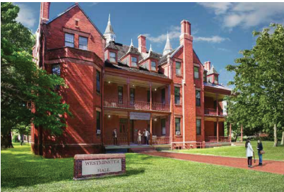
Rendering of the reconstructed Westminster Hall.

Vision, New Purpose, and Mission Westminster Hall, one of the three original buildings on campus, was built in 1897. The treasured building was home to generations of students and a center of hospitality and companionship. In recent years, the building has been vacant while Union waited for the right moment to refurbish the 120-year-old structure and recast it for a vital, strategic new purpose.