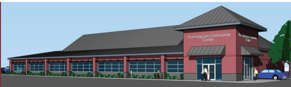
Perspective view of PCC’s future facility at 1228 Jamison Ave.

In 2018, PCC provided $166,970 in resources through the Emergency Services Program: benefiting 5,556 individuals which included 1,368 senior citizens and 1,692 children.