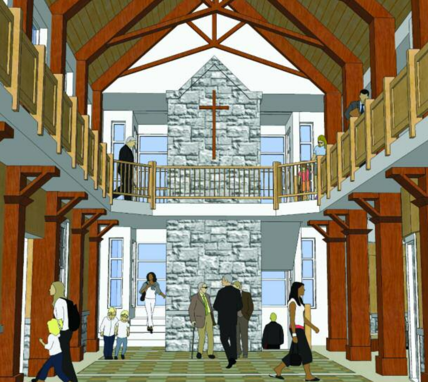
Architectural rendering of interior view of new entrance to the church.